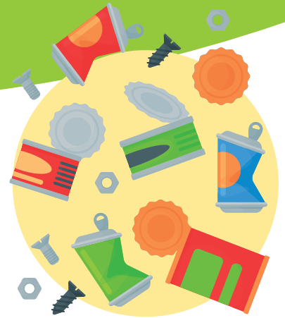
Steel & aluminium cans