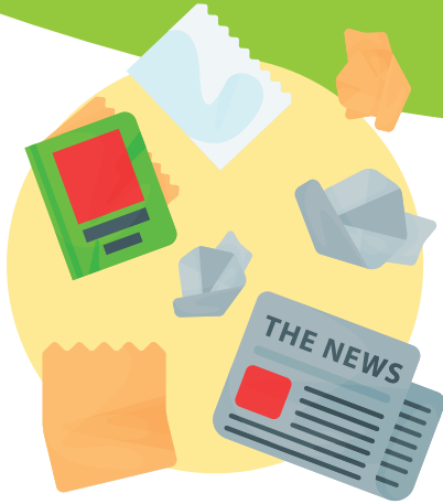
Newspaper, paper & magazines