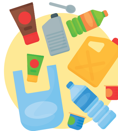
Plastic bottles & containers (remove lid)