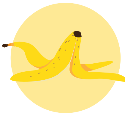
Food or green waste