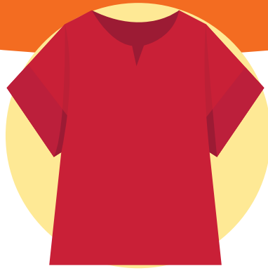
Clothing or textiles