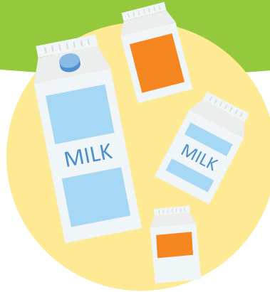
Milk & juice cartons (no foil lined cartons)