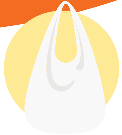
Plastic bags or soft plastics