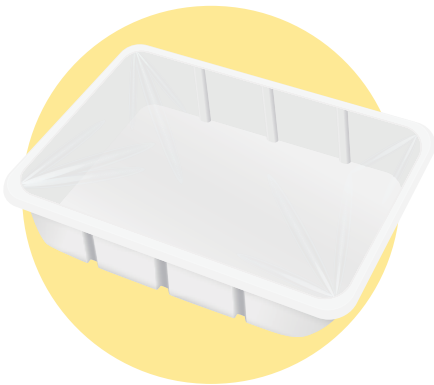
Polystyrene, meat trays, cups or beads